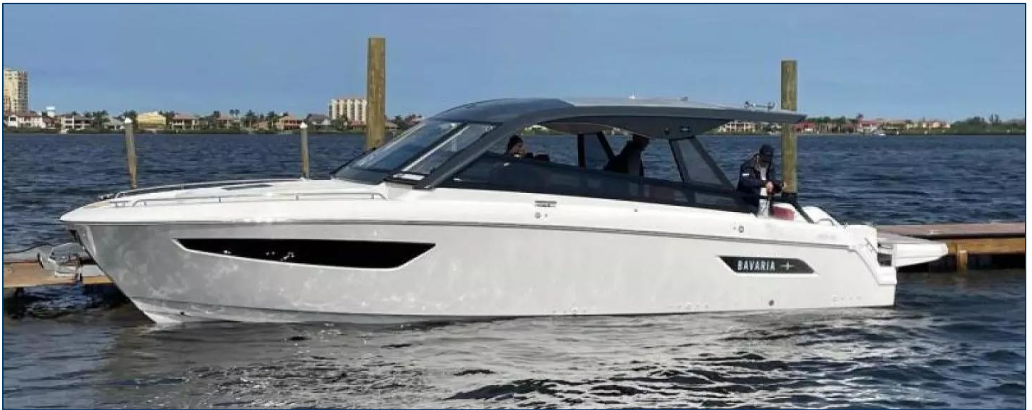
2023 Bavaria Vida 33 $418,540 (A savings of $69,000 – Maintained by Bavaria Yacht dealership)